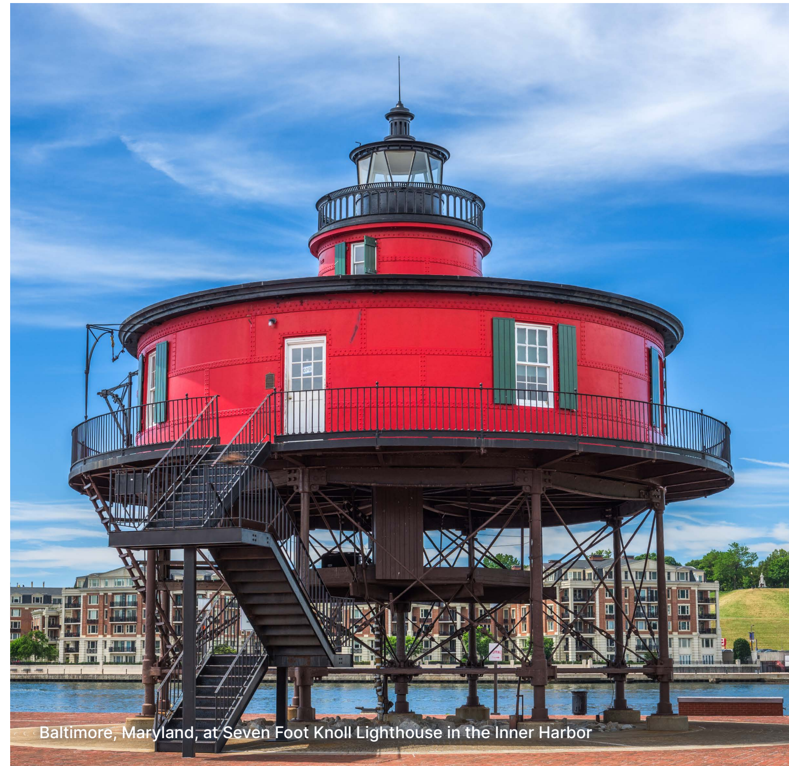
Baltimore, Maryland, at Seven Foot Knoll Lighthouse in the Inner Harbor